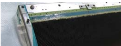
Boeing 737 honeycomb composite repair

Strategic partners with design capabilities.