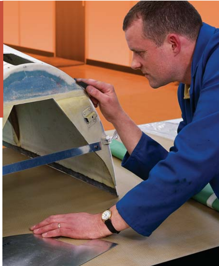
125 Ventral Fairing Composite repair

Working with strategic partners we are able to support airline requirements with services beyond the traditional repair process, aiming to deliver a service that meets the demanding environment presented today.