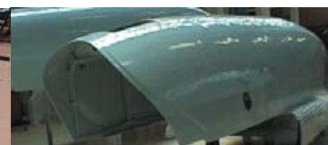
Right: Boeing 747 boat fairings composite repairs